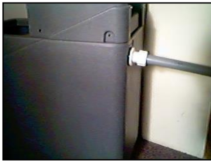
Rigid overflow (Fig. 1)