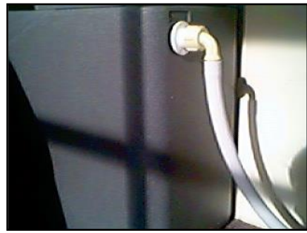
Flexible overflow (Fig. 2)